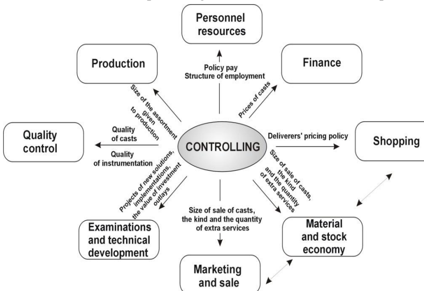
Fig. 1. Main relations of controlling system with impact put on purchases and sales logistics processes.