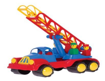
Fig.1. Fire brigade

The discussed product on which it is focused at work is a toy - fire brigade (Fig. 1).